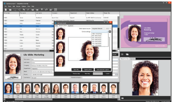
Managing and producing cards in BadgeMaker.

Company identity with a clear and professional card design is not the only feature Badgemaker offers, the software also brings accessible data management and effective card production.