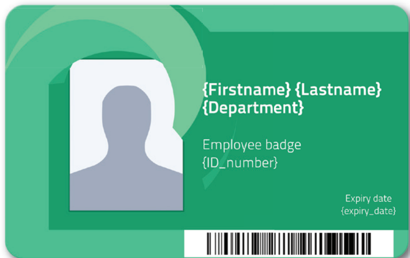
Photo capture features facial recognition, automatic crop and a three-picture snapshot.