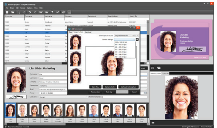
Managing and producing cards in BadgeMaker.

Company identity with a clear and professional card design is not the only feature Badgemaker offers, the software also brings accessible data management and effective card production.